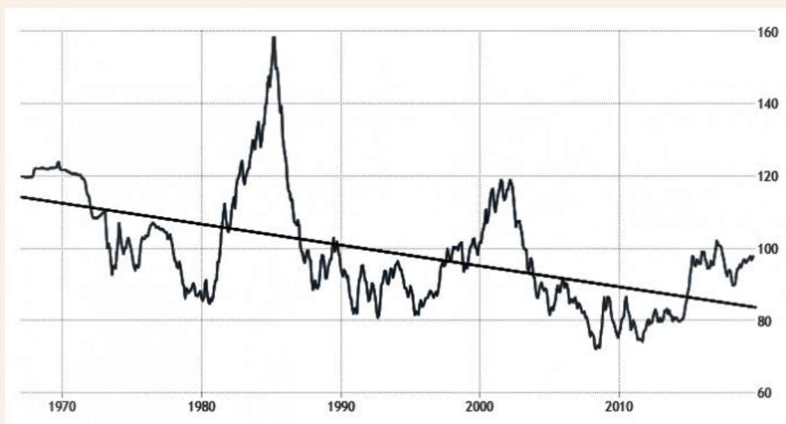
Figure 3: US Dollar Index, 1965–2019

Since then, the US dollar has entered into a long decline, interrupted by two episodes. Under the Reagan presidency, the Cold War entered into its final period, and the dollar became the currency of refuge for some time. The US victory in this battle appeared as a replay of the endings of World War I and World War II with the United States emerging for a third time on top of the world. In the 1990s, the triad of global dominance seemed well in place for the United States: unrivalled military might, a booming and innovative economy, and the status of undisputed issuer of the global currency. The US dollar experienced another period of strength. Since 2002, however, the long-term trend toward a weaker dollar is back in place, interrupted by lower peaks of the waves of strength (see Figure 3).