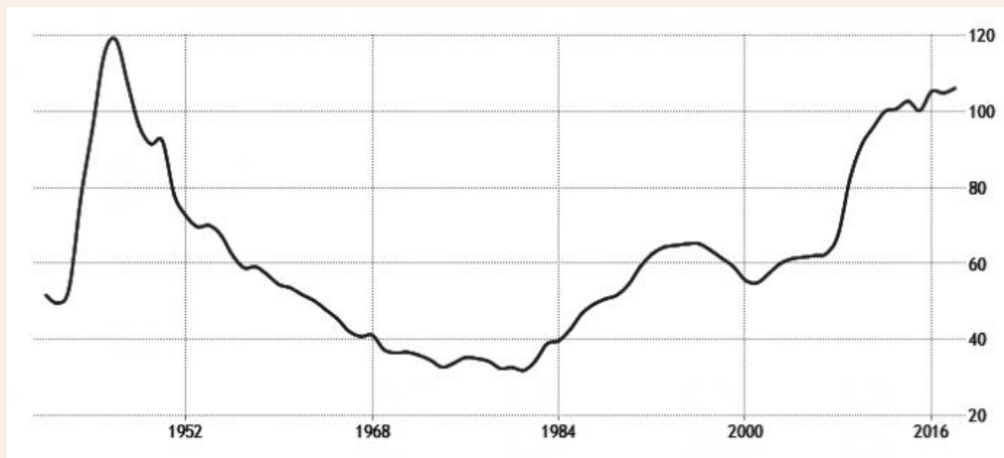
Figure 1: US Gross Federal Debt Ratio (Debt in percent of gross domestic product), 1940–2018