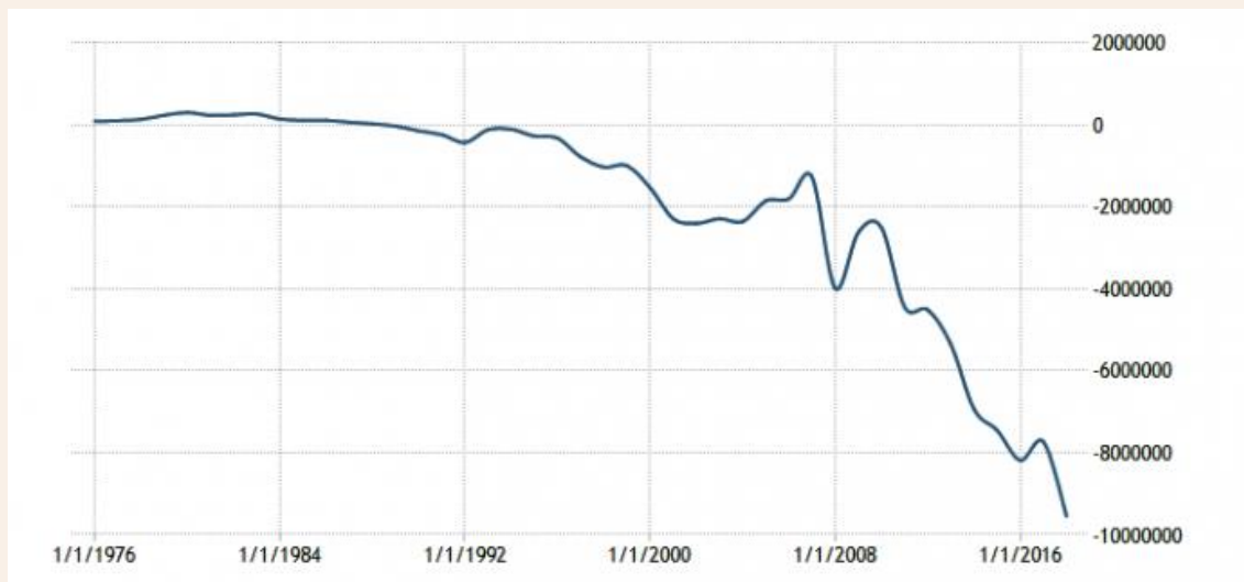
Figure 4: United States net international investment position, 1976–2019 (in million US-dollars).